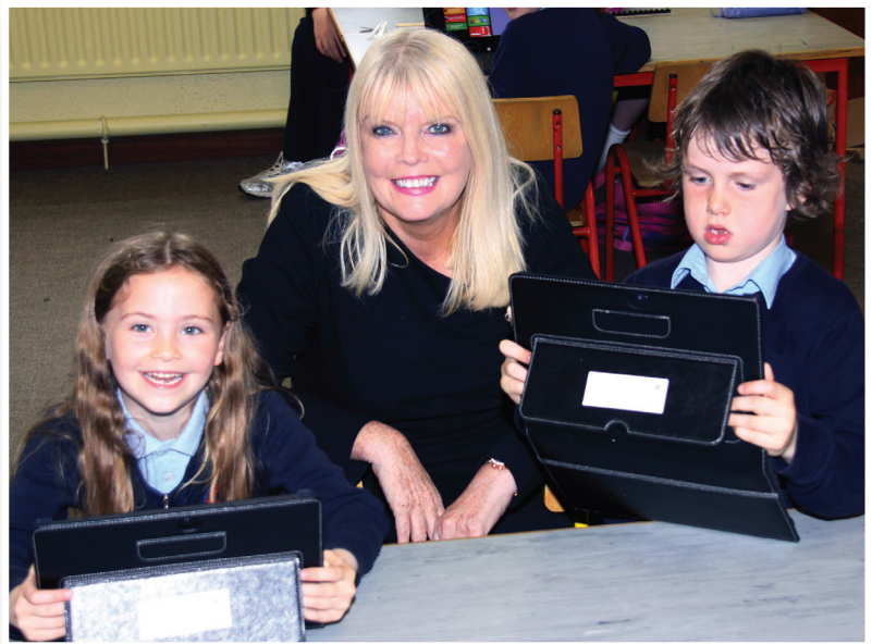
Investing in education today for the talent of the future.

However, it is not just about more spending, it is about working smarter. We have merged or closed over 180 agencies.